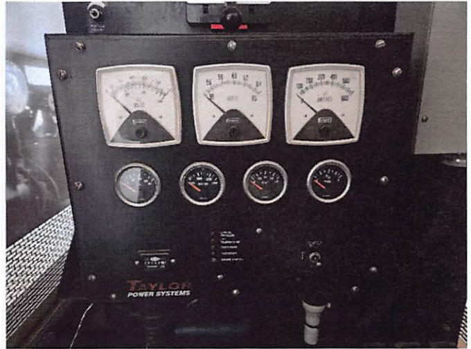
Other Images If Applicable